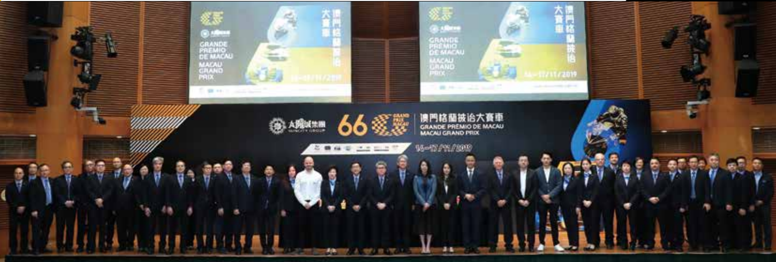
MEMBERS OF THE MACAU GRAND PRIX ORGANIZING COMMITTEE ANNOUNCED ENTRIES FOR THIS YEAR'S GRAND PRIX AT A PRESS CONFERENCE IN OCTOBER