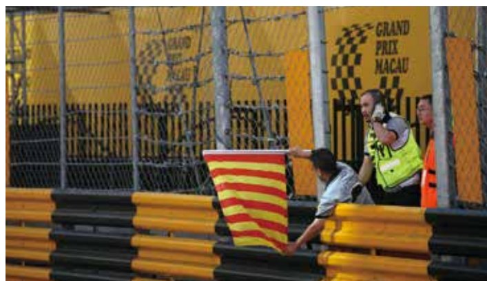
THE YELLOW AND RED STRIPED FLAG WARNS OF DEBRIS OR SLIPPERY FLUIDS ON THE TRACK

As the host for three FIA World Cup Events, Macao adopts the FIA flag system. The advantage of such a standardized system is that once drivers have learned the meaning of each coloured flag, the same flags will have the same meaning at any race track they visit throughout their careers.