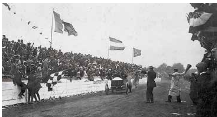
A CHEQUERED FLAG WAS USED TO MARK THE FINISH OF THE 1906 VANDERBILT CUP RACE IN NEW YORK AND HAS BEEN USED AT MACAO FROM THE EARLIEST DAYS OF THE GRAND PRIX

During a practice session or a race, communication with the competitors is crucial, and visual indicators in the form of different coloured flags waved by the side of the circuit have, over decades, proved to be the most effective – method of disseminating information to drivers and riders going at full speed around the race track.