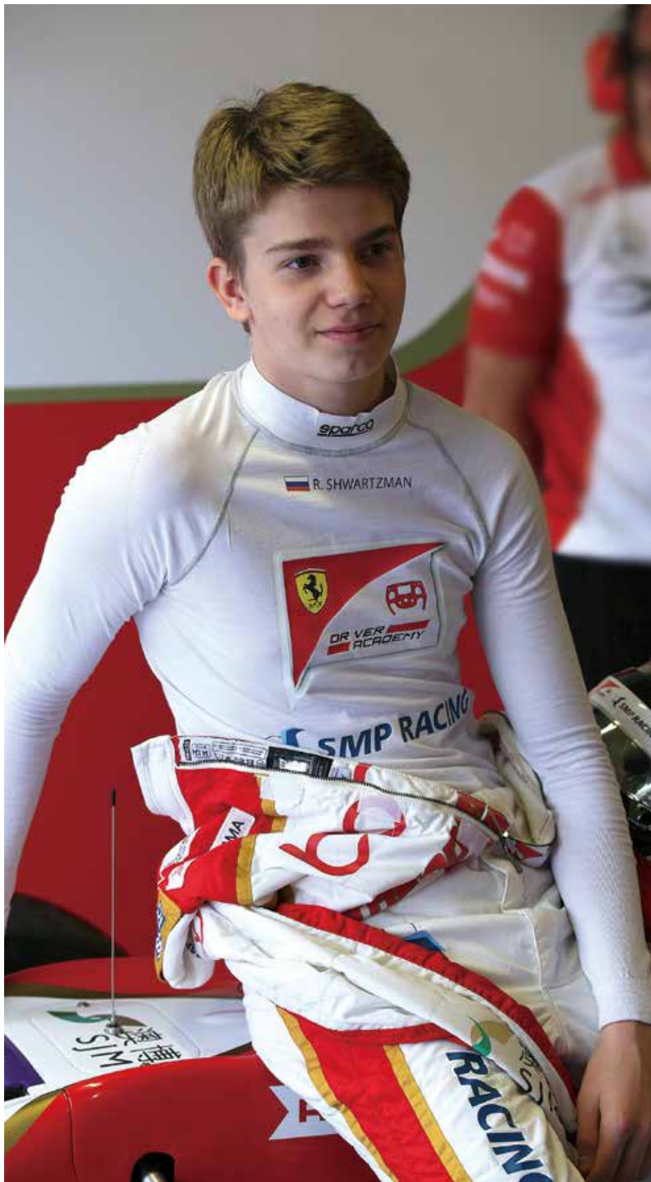
ROBERT SHWARTZMAN MADE HIS GUIA CIRCUIT DEBUT IN 2018

When 20-year-old Russian Robert Schwartzman arrived for the start of the new FIA Formula 3 Championship in May this year he joined a field of similarly gifted young single seater drivers. However, the St. Petersburg-born driver already had an impressive CV to his name.