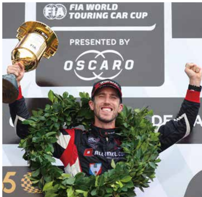
WINNER OF RACE 3 IN 2018, ESTEBAN GUERRIERI

Huff is joined on the team by Macao winner Mehdi Bennani of Morocco, while another former winner, Norbert Michelisz, is the man to beat having emerged as the front-runner in a four-car Hyundai line-up. The Hungarian is partnered in the BRC Hyundai N Squadra Corse line-up by Gabriele Tarquini, who claimed last year's inaugural FIA WTCR drivers' title by three points in a gripping season finale in Macao. Honda's title challenge in the FIA WTCR this year has been headed by the winner of that race, Esteban Guerrieri.