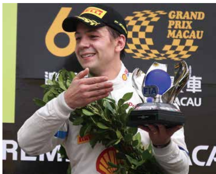
DEFENDING MACAO GT CUP – FIA GT WORLD CUP CHAMPION AUGUSTO FARFUS JR.

The line-up for this year's SJM Macau GT Cup – FIA GT World Cup includes no fewer than four former champions: 'Mr. Macao' Edoardo Mortara, Maro Engel, Laurens Vanthoor and reigning champion Augusto Farfus Jr.