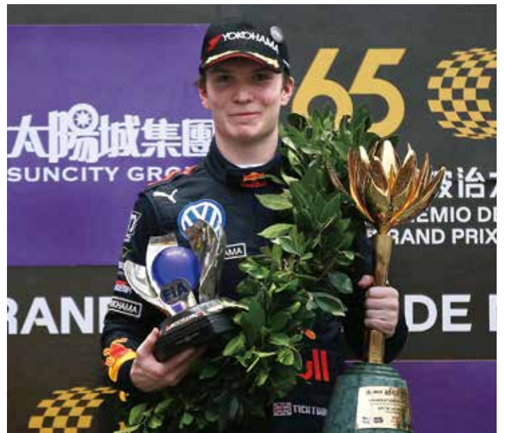
TWO-TIME RACE WINNER DAN TICKTUM

In order to accommodate the new Formula 3 cars, the FIA mandated an array of circuit