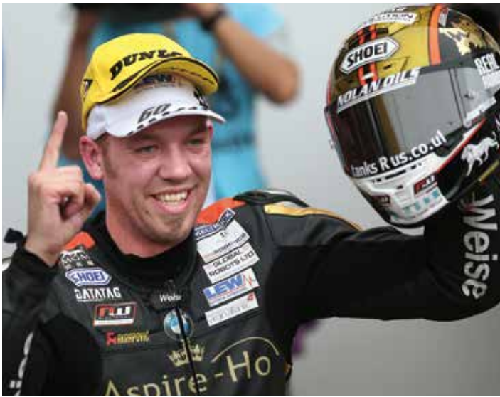
THREE-TIME MACAU MOTORCYCLE GRAND PRIX WINNER PETER HICKMAN RETURNS ON THE HUNT FOR VICTORY NUMBER FOUR

Eight-time winner Michael Rutter is the most successful rider in the race's history with victories spanning 1998 to 2012, and he will be gunning for his ninth win aboard the MotoGP-specification Honda RC213V. Alongside him will be Peter Hickman, who scorched to his third victory last year to add to his successes in 2015 and 2016, and will ride a Smiths-prepared BMW once again.