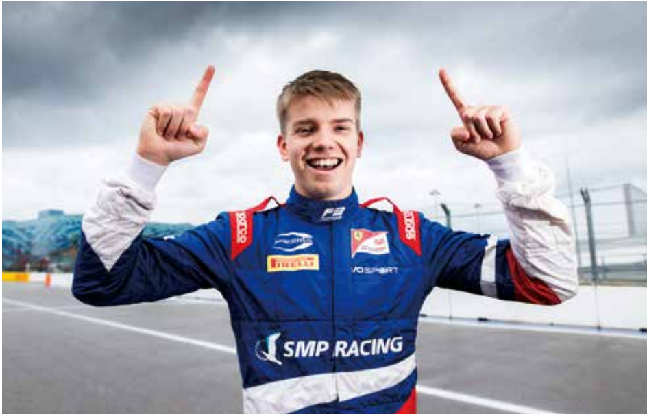
SHWARTZMAN IS CROWNED 2019 FIA FORMULA 3 CHAMPION