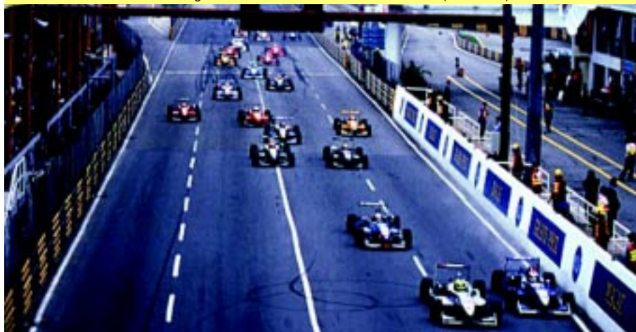
The charge is on in the 47 th Macau Grand Prix (SUTTON)

The Macau Grand Prix Organising Committee is also embarking on a worldwide promotional campaign to highlight the attractions of the event, the only international motor racing weekend to feature both car and motorcycle races, and one of the oldest, continuously-run events in the world.