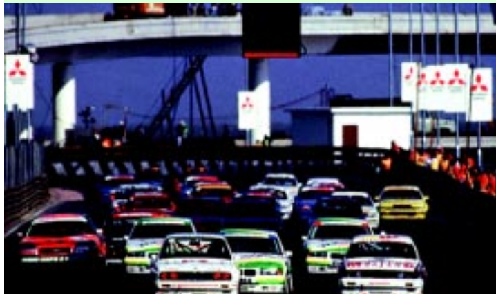
The 1993 Macau Guia Race