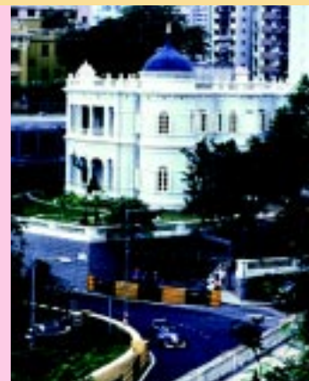
Macau's glamorous Guia street circuit

Facilities for the almost 1,000 local, regional and international media covering the Grand Prix will also be upgraded, with a 555 square metre semi-permanent structure on the roof of the Grand Prix building earmarked as a media lounge. Telecommunications facilities will be improved to provide faster and more efficient computer connectivity.